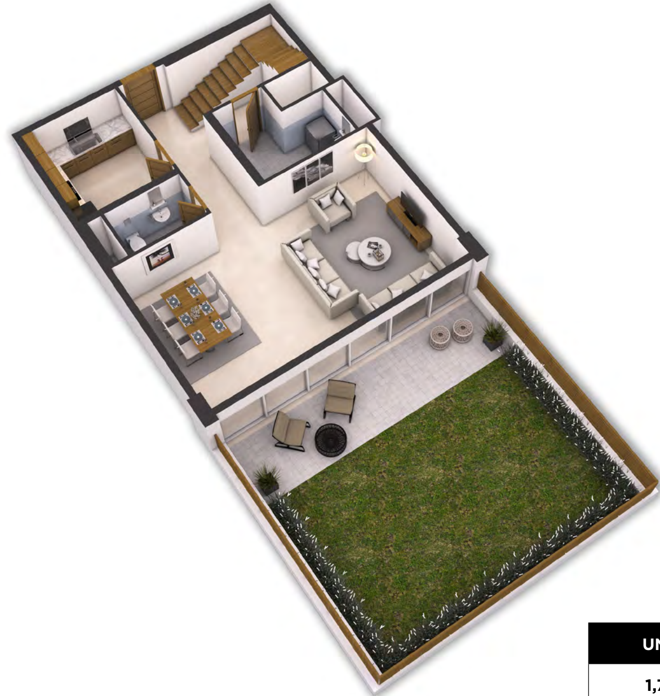
TOWNHOUSE - GROUND FLOOR 3D UNIT PLAN